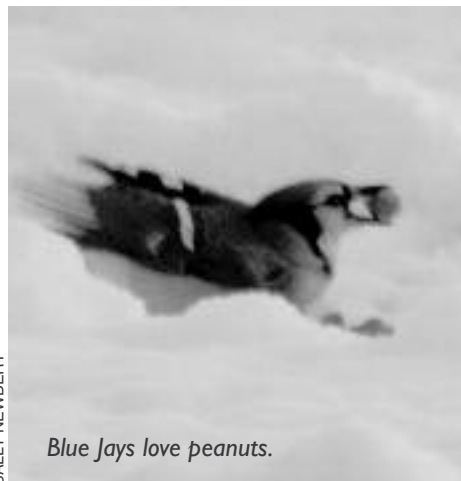
Blue Jays love peanuts.