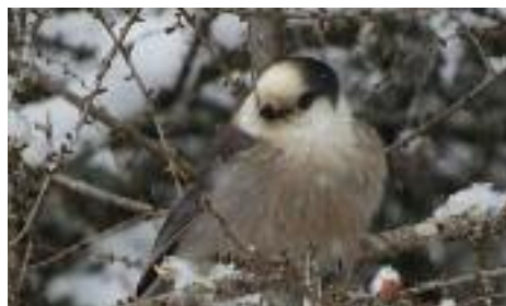
A few highlights: clockwise, a Hawk Owl, a Great Gray Owl, a Gray Jay, an Evening Grosbeak, a Pine Grosbeak, and a Snowy Owl.