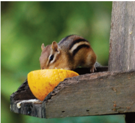
An orange put out to attract an Oriole, instead a chipmunk. If you would like to submit pictures of the birds or other critters on your bird feeders to be used with this column please send them to eliasosprey@optonline.net .