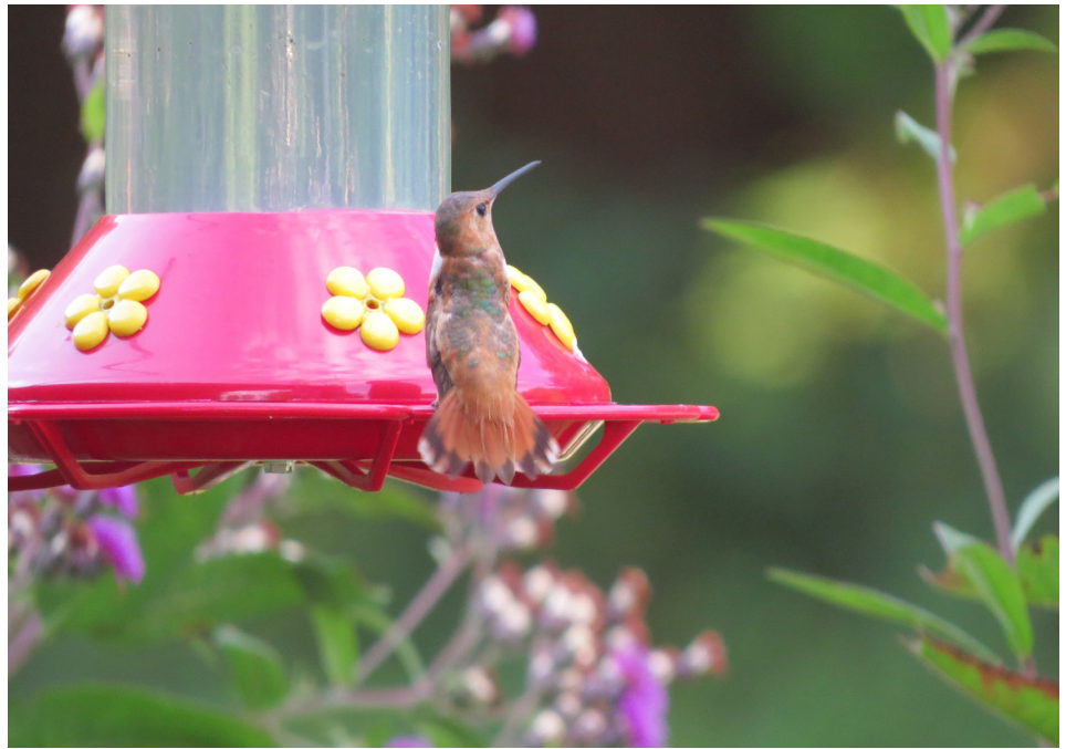
The first Rufous Hummingbird seen at Elizabeth Morton Wildlife, as quickly as it was reported, it was gone.